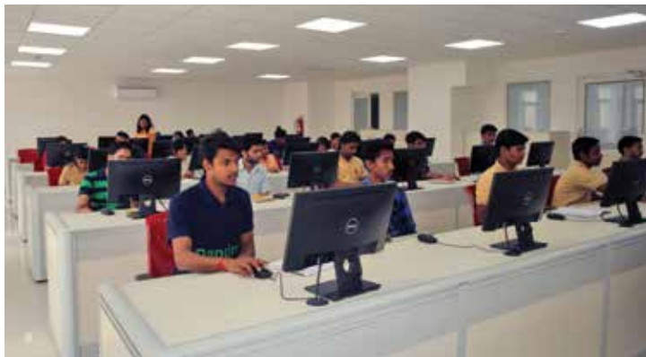
Key Project Intervention Areas

Sambhav Foundation (the implementing partner) works at the grass root level to ensure and provide complete end-to-end solutions from identifying the beneficiaries till the time they start earning decent livelihoods with the help of skills imparted to them through the interventions.