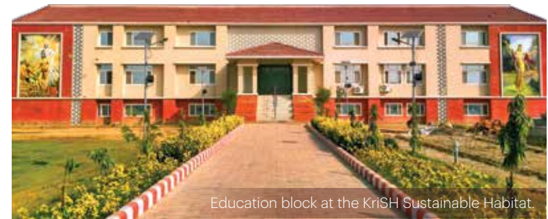
Education block at the KRISH Sustainable Habitat.

ISKCON (The Implementing Partner), established in 1966, is a non-profit organisation with cultural and charitable activities running across its centres globally. The organisation conducts a wide span of activities in livelihood creation, village development and women empowerment via organic food and dairy enterprises. Some of its key interventions include 10 eco-village establishments in India and farm communities engaged in rural development and livelihood transformation through farming.